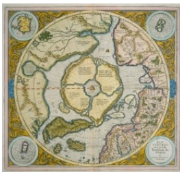
Gerhard Mercator. Septentrionalium Terrarum descriptio. 1595 (a polar map)