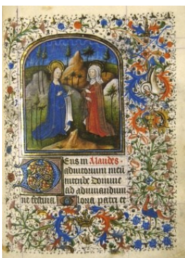
Visitation, from the Heures de Notre Dame selonc lusaige de Rome. c.1400.

The Newberry, Chicago's Independent Research Library since 1887, celebrates its quasiquicentennial (125th anniversary) with an exhibition of 125 of the millions of books, maps, manuscript pages, drawings, and photographs in its collection. The featured items embody the Newberry's mission to provide relevant research and learning opportunities. The Newberry 125 are some of the Newberry's most immediately awe-inspiring and most utilized documents and artifacts.